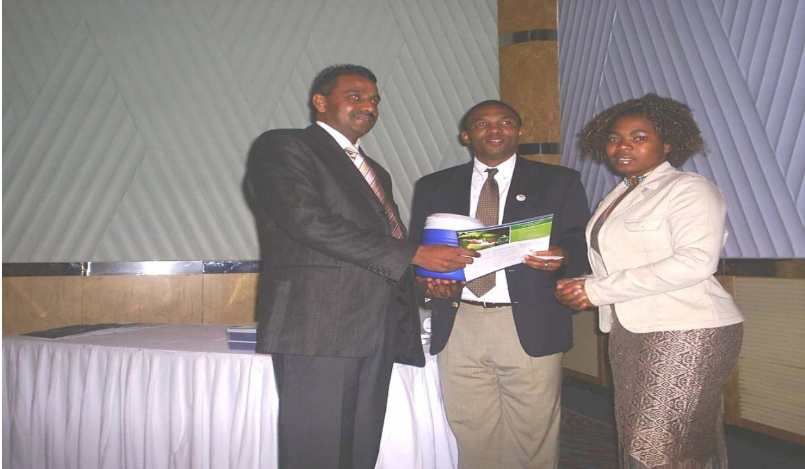
Colortrade Paints received an award for being the most improved established SMME.