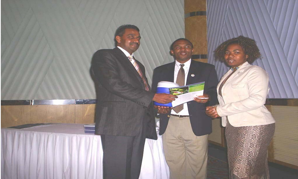
Colortrade Paints received an award for being the most improved established SMME.