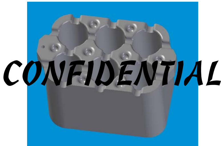
View of base of hebcooler

iii. Hebcooler (client: BVK, small company, 100% PDI owned). This project involved designing an innovative hebcooler that keeps 6 cooldrinks colder for much longer than usual. The TS will also be involved with designing and fabricating the tooling to injection mould this product, which will be exported.